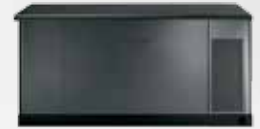
25kW 2 Generator 71" x 32.3" x 37"