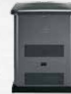
8-10kW 2 Generator 28" x 24.4" x 35.1"