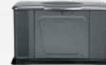
16-20kW 2 Generator 48" x 34" x 31"