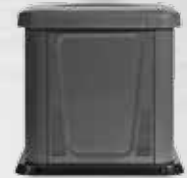
12kW 2 Generator 35" x 40" x 39"